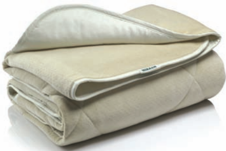
Kenko™ Dream Personal Comfort Pad