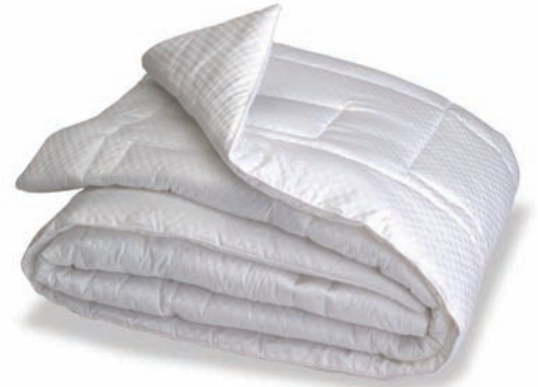
Kenko™ Dream Comforter