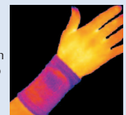
KenkoTherm Wrist Wrap